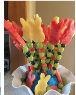
PEEP those fruit kabobs from our very own kitchen crew!