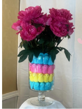
Table Decor thanks to Allison Perz!